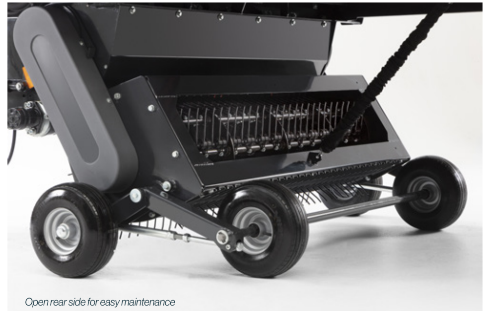
Open rear side for easy maintenance