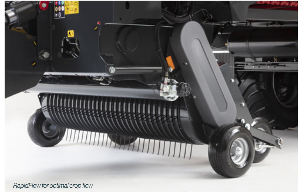
RapidFlow for optimal crop flow

The combination of the unique Schuitemaker Trailing pick-up, the RapidFlow feed roller and the powerful, smooth PowerRotor, makes the loading process even easier, more economical and more efficient than ever before. This way you effortlessly achieve the optimal result.